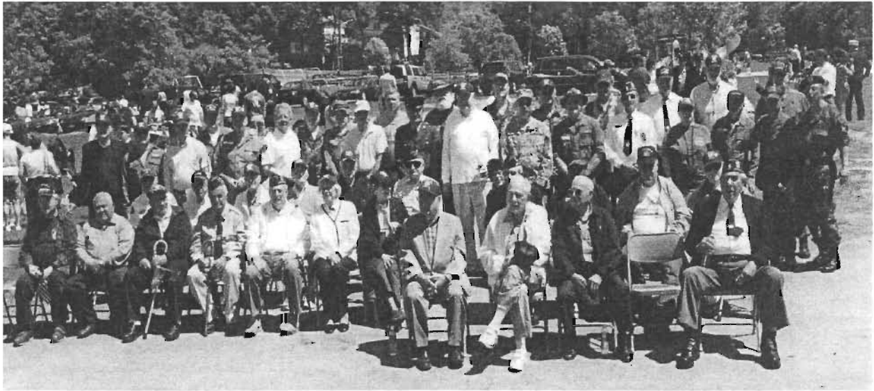
Current members of Ardsley American Legion Post #458 - Memorial Day 2008

Ardsley Historical Society P. O. Box 523 Ardsley NY 10502-0523 www.ardsleyhistoricalsociety.org